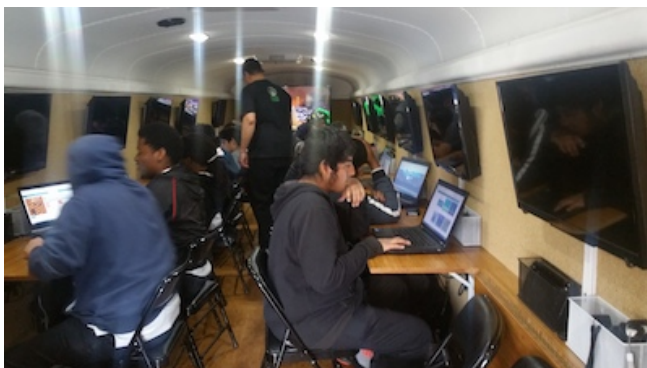
At left, introduction to basic computer literacy and programming in The Tech Mobile , a mobile computer classroom of Computerworks Global .